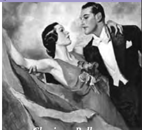
Charisma Ballroom 71-46 Main Street • Kew Gardens Hills 718-268-2800

One Free Soda • Cash Bar Coffee/Cake Served